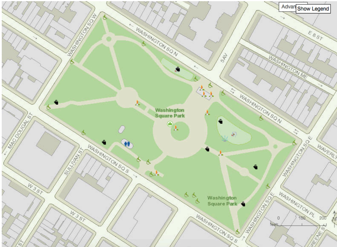
Fig. 1. Washington Square Park.