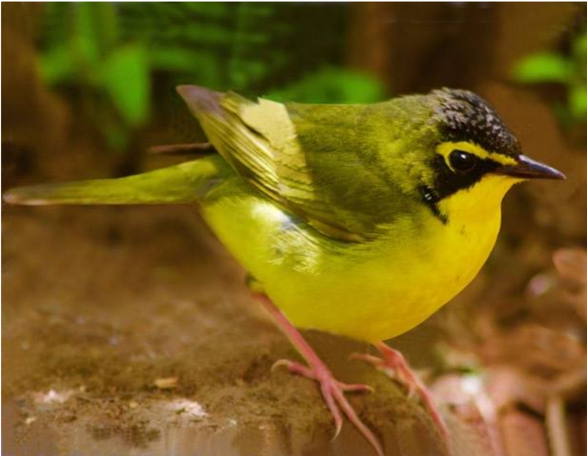
Figure 3. Kentucky Warbler, Washington Square Park, May 15, 2017, photo courtesy of Dennis Edge.

As we wrote last year, the park is composed of several microhabitats. The major distinguishing factor of these microhabitats is the types and layers of vegetation. As we did last year, we noticed variations in the species and the number of individuals found in the park's microhabitats. The Washington Arch meadows again supported species richness. The Kentucky Warbler spent much of its layover in this area of the park. In contrast, fewer species and individuals were observed in the Holley Plaza Meadow (north). The herbaceous perennial layer in this area was less diverse and sparse than in 2016. Last year the English Elm was a hotspot for birds in the park. This was not the case in 2017. Although the English Elm was less activated, the midstory in the northwest corner of the park was a hotspot for sapsuckers and warblers. Additional dynamic spaces were the meadow and lawn between Holley Plaza and the administration building as well as the northeast corner of the park.